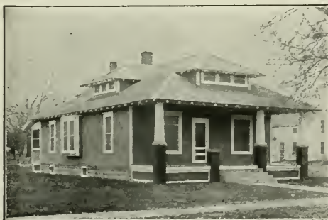
BENNINGTON, KANSAS (Mause)